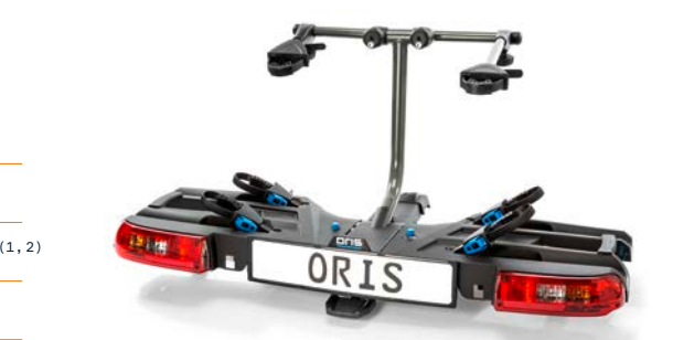
ORIS TRACC Part number: 700-002

(4) When using the optionally available long ratchet strap (50 cm)