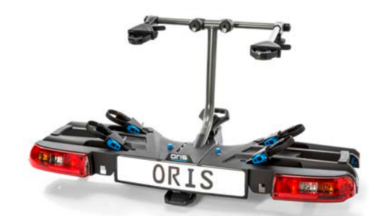
ORIS TRACC FIX4BIKE Part number: 710-002

ACPS Automotive Services GmbH Advanced Carrier and Protection Systems Regioparkring 1 41199 Mönchengladbach Germany